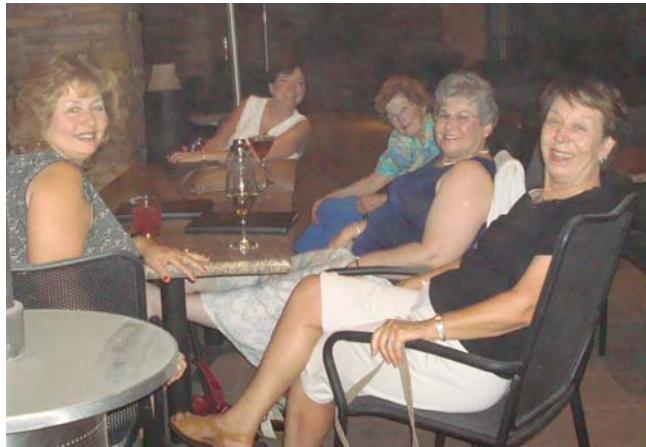
Enjoying the Weather!