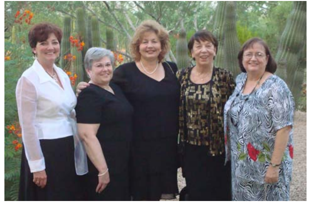
All Dressed Up for the Banquet!